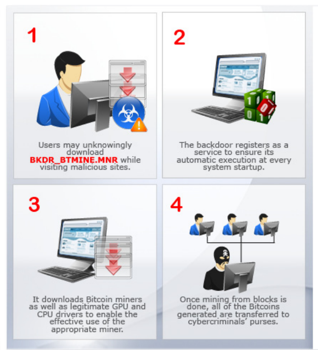
Figure 1. BKDR_BTMINER.MNR's infection diagram